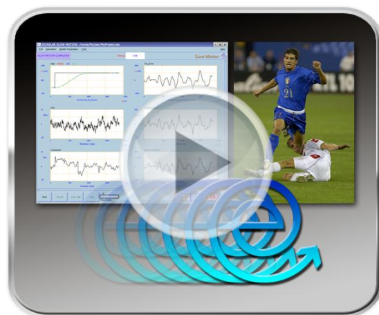
Slow Motion tool